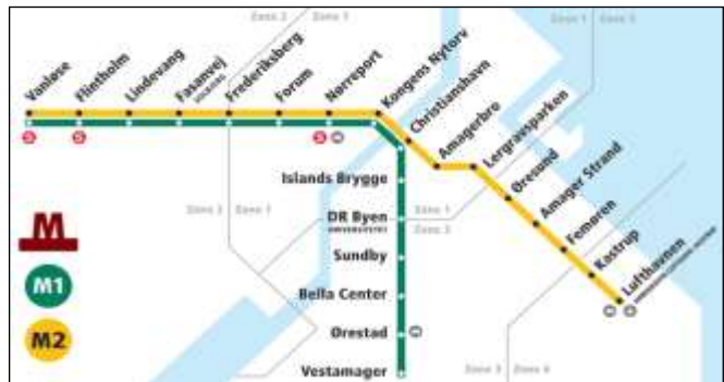
The Metro in Copenhagen

You can bring your bicycle with you on the S-trains (not Metro) for free, but note that you may not get on or off trains with your bicycle on Nørreport st. during rush hour!